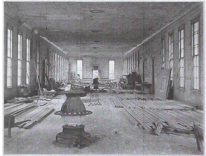
Fig 8.3. Hundreds of ghosts cannot be seen attending the Hart Island Cemetery's annual gala as ghosts do not appear in photographs. They are invisible.

In September of 1963, a radical idea was suggested by mayoral candidate John V. Lindsay. He campaigned on the idea of Moving Week. His suggestion was that in the first